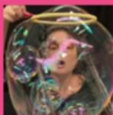
Bubble Fairy Show