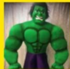
Take a selfie with the Hulk